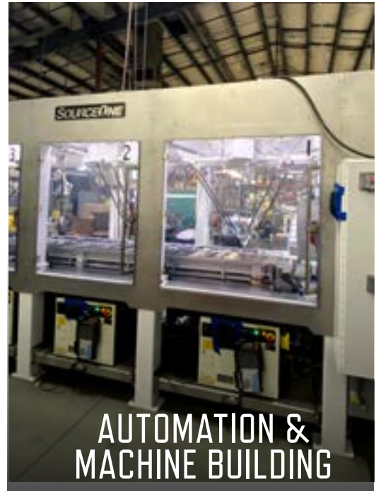
AUTOMATION & MACHINE BUILDING